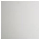
OP71 matt white