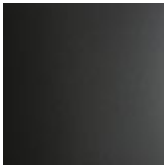
OP69 matt graphite