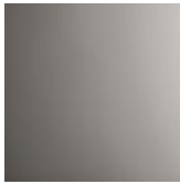
polished stainless steel